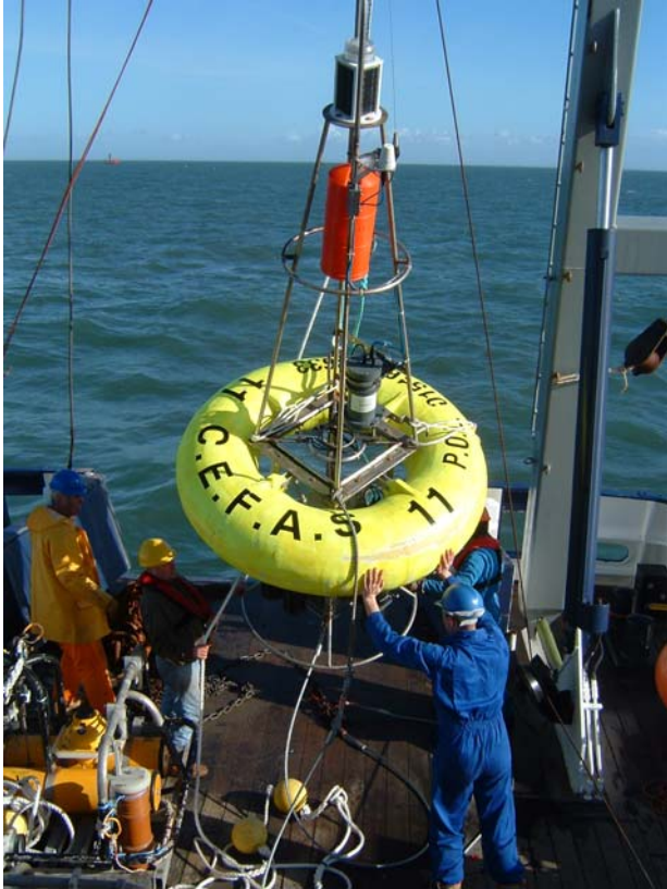
A SmartBuoy is deployed in Liverpool Bay to assess nutrient status and ecosystem response